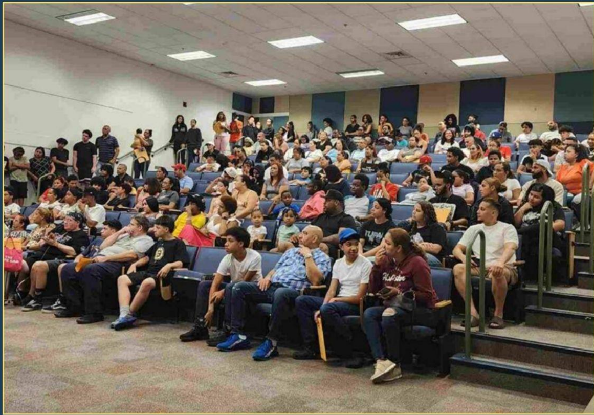
FRESHMAN ORIENTATION SESSION (300+ FAMILIES AND STUDENTS)