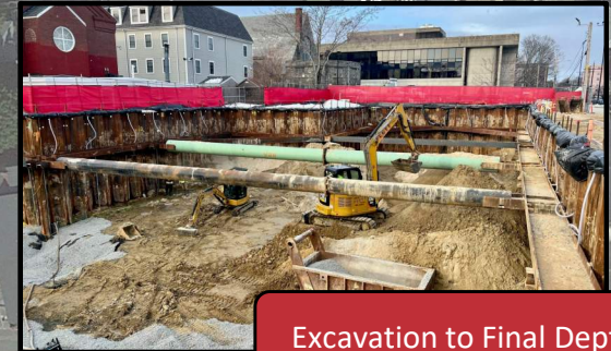
Excavation to Final Depth - West