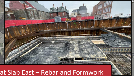
Mat Slab East – Rebar and Formwork