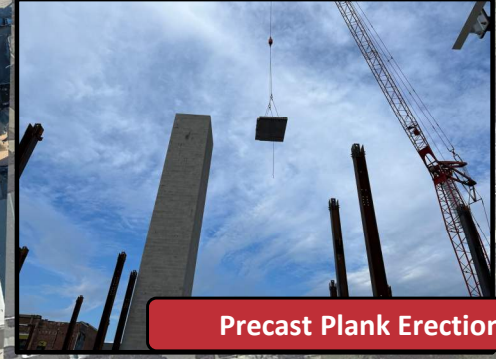
Precast Plank Erection