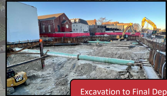
Excavation to Final Depth - West