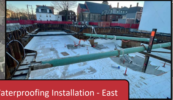
Waterproofing Installation - East