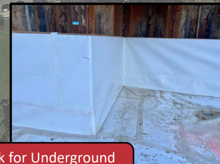
Detail Work for Underground Waterproofing