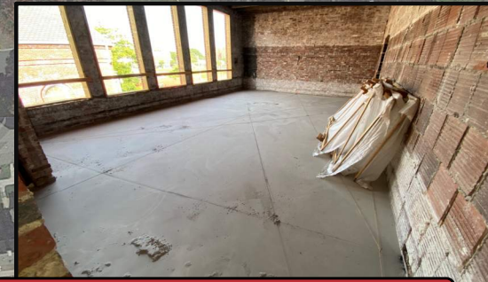
Cement Leveler in Existing Classrooms