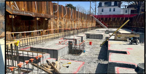
Completed Mat Slab Placement - East