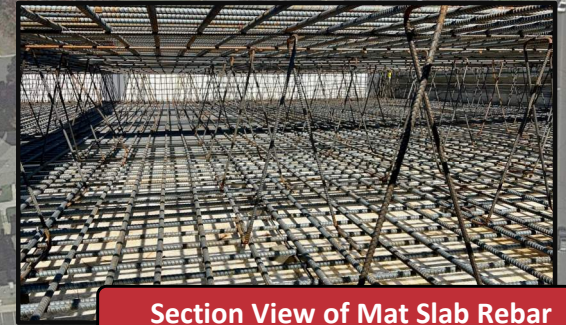
Section View of Mat Slab Rebar