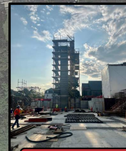
Elevator CMU Shaft Install