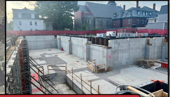
Completed Concrete Foundation Walls