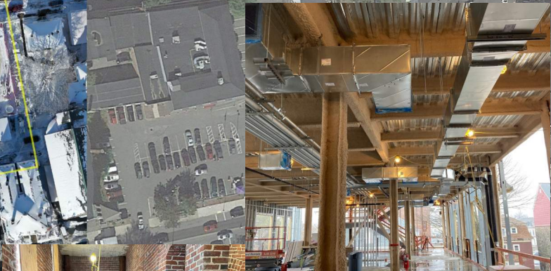
Overhead MEP Rough-In