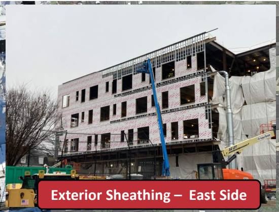
Exterior Sheathing – East Side