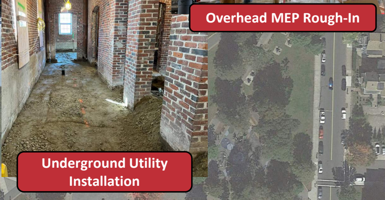
Underground Utility Installation

Drone Link: https://vimeo.com/911627773/3a72411d0d?share=copy