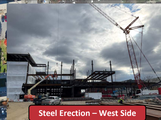
Steel Erection – West Side