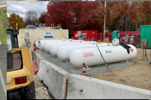
Propane Tanks for Temp. Heating

Drone Link: https://vimeo.com/884094322/f2ece1e922?share=copy