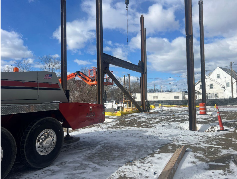
Phase 3 of 3 steel erection commenced on February 16, 2024 and continues.