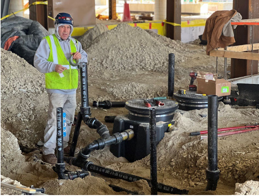
The elevator oil separator tank piping progress as of February 29, 2024.