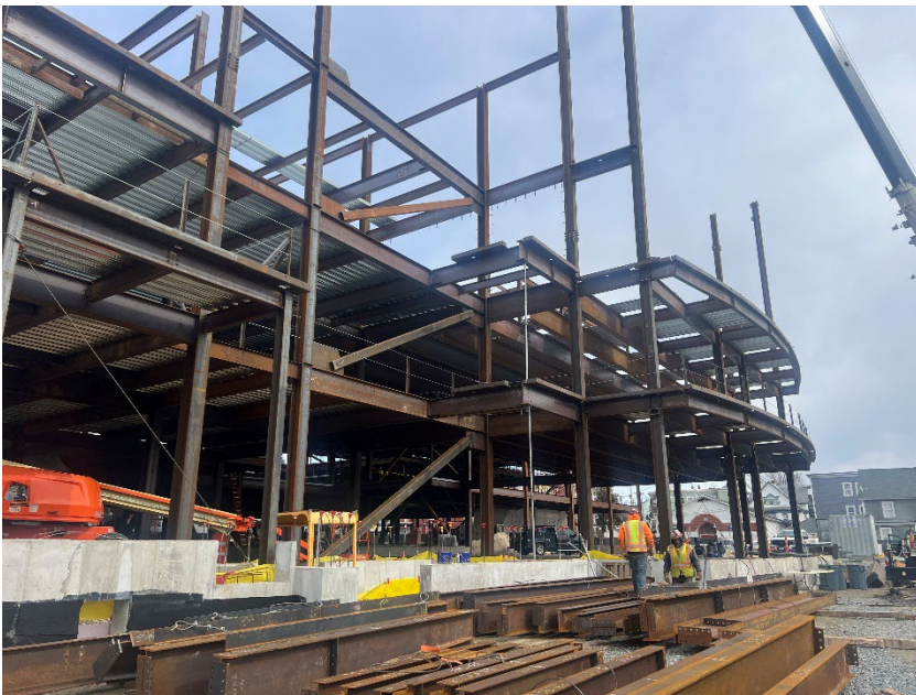
Progress of Phase 3 steel work as of February 29, 2024.