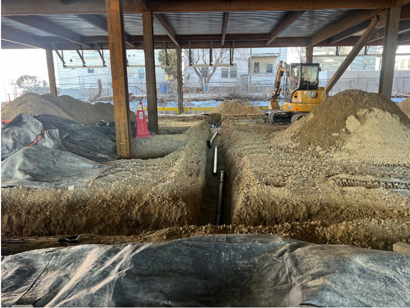
Underground plumbing and electrical work began on February 13, 2024, and continues.