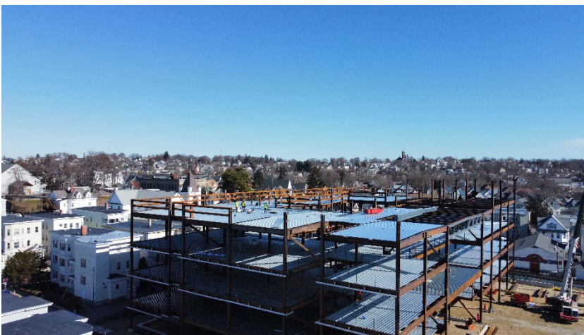
Aerial view taken on February 12, 2024.