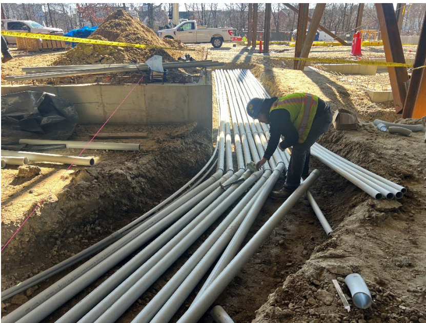
Electrical underground conduit installation, as of February 20, 2024, and ongoing currently.