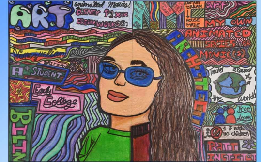
Past and Future Colored Pencil & Sharpies