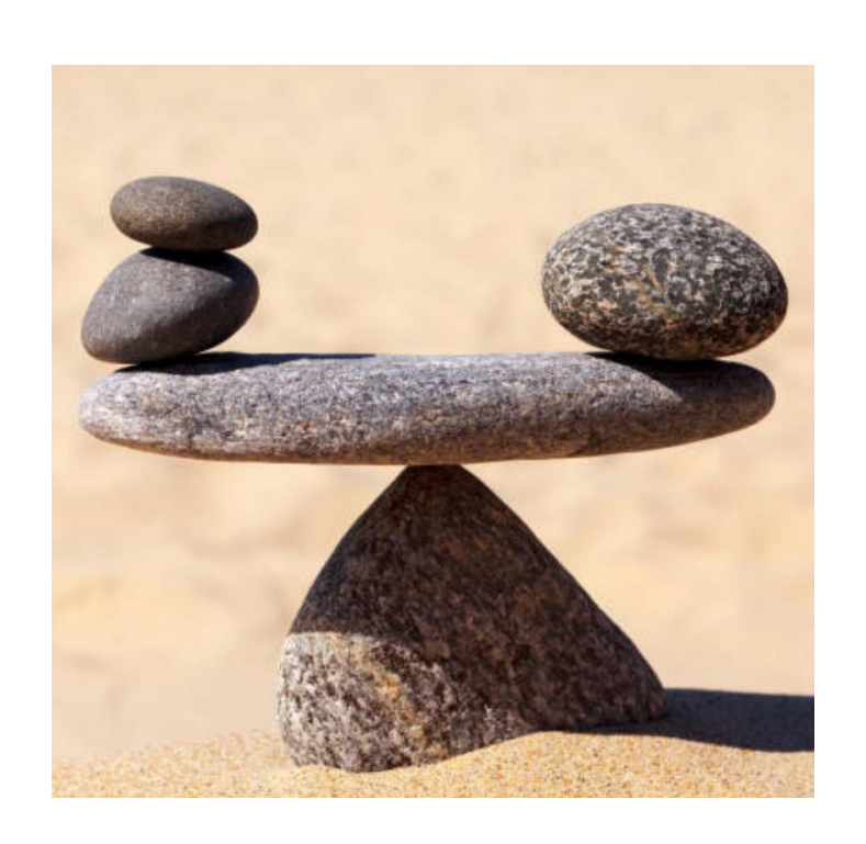
Agnostic on Approach